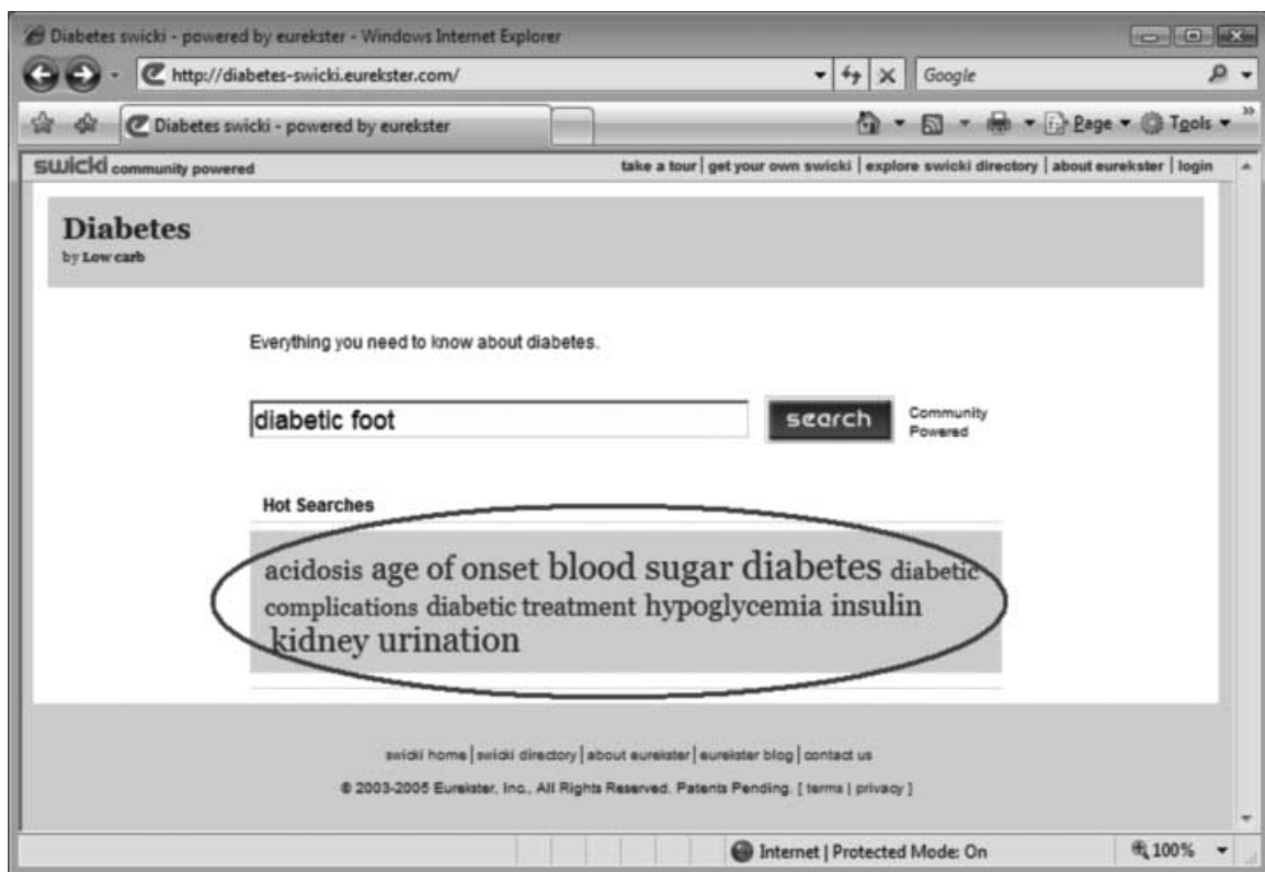
Figure 2 The BuzzCloud (tag cloud) of an Swicki about diabetes

Because social bookmarking services indicate who created each bookmark and provide access to that person’s other bookmarked resources, contact is easily made with other like-minded individuals. 35 Some social bookmarking services combine features of other Web 2.0 applications like blogs and social networking services, allowing users to discuss content, and post and share personal profiles, beyond tagged bookmarks or media files. 37 Shadows ( http://www.shadows.com/ ), for example, supports ‘Shadow pages’ for bookmarked pages. Other web resources can be discovered, folksonomically tagged, and shared in