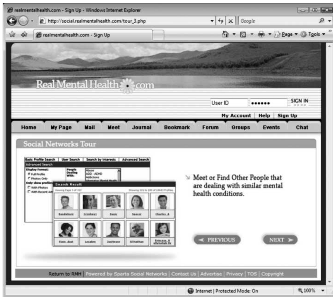
Figure 3 Screenshot from http://social.realmentalhealth.com/

Medical and health-related examples of social networking services include the LibraryThing Medicine Group ( http://www.librarything.com/groups/medicine ), a library social network site promoting social interactions, book recommendations, self-classification, and monitoring of new books, and the MySpace 'CURE DiABETES group' ( http://groups.myspace.com/cureDiABETES ) run by patients and supporters. Some social networking services combine or bundle several Web 2.0 tools/features together, e.g. instant messaging (see below), social bookmarking, blogs and podcasts. Examples of these services include the Mental Health Social Network ( http://social.realmentalhealth.com/ —Fig. 3),